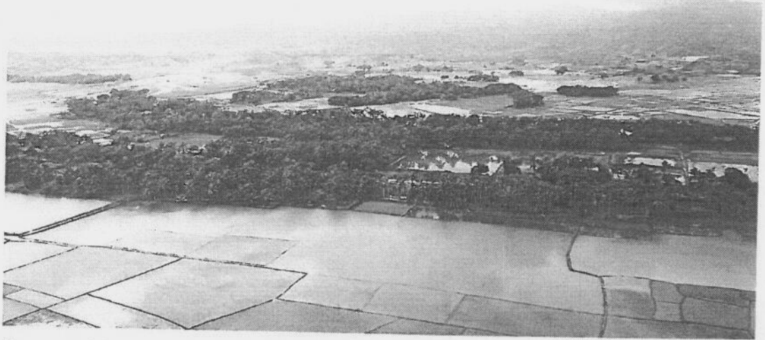
Peace and development for this beautiful land

The answer to Rakhine situation lies within Myanmar. We will find the solution in line with national interest and the international norms and standards. Constructive engagement by the international community would help Myanmar in finding solutions to the issue.