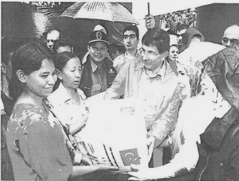
Assistance from Turkey