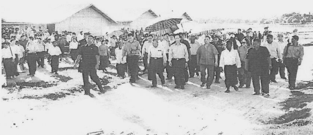
High level visit underlines the importance attached to the issue