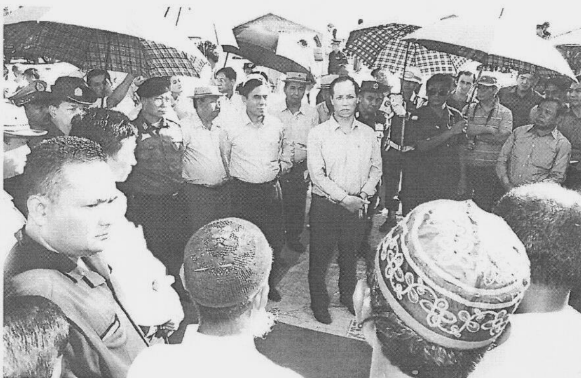
Vice President listening to IDPs

Anxiety and distrust between the two communities particularly at the grass roots level is still high. Advocacy to understand and accept peaceful and harmonious co-existence among different faith and races is one of the highest priorities of the government. President U Thein Sein called on the people to pay mutual respect on different beliefs and to promote peace and harmony and to join hands with the government, civil societies and elders. The President urged the Interfaith Friendship Group to work nationwide to help implement three main priorities of rehabilitation, prevention of conflicts and developing a long-term plan to resolve root causes.