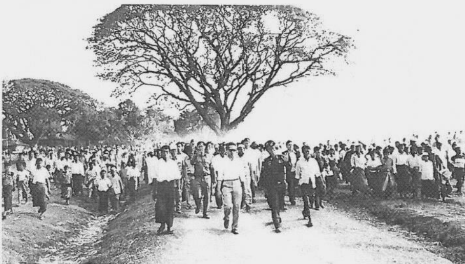
Indonesia Foreign Minister Mr. Marty Natalegawa visiting camps near Sittwe